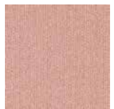
Rose Quartz 2693-304