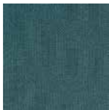
Dark Turquoise 2693-508