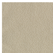
Malted Milk 4108-105