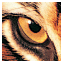
Saved at 150 dpi