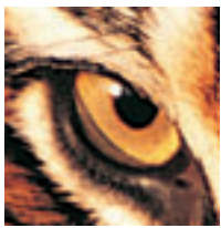
Saved at 72 dpi