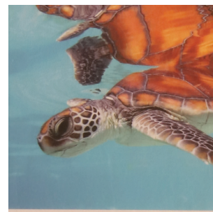
Printed on the color cotton

Note: Due to the recycled nature of the product, minor imperfections in the printing process can occur.