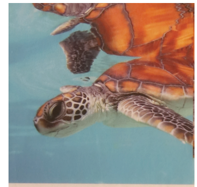
Printed on the color cotton